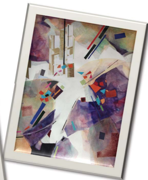
2018 Aqueous exhibitors-above: "Mosaic Blast" Rita Montrosse; left: "Old Blue Truck" by Carol Hilleary