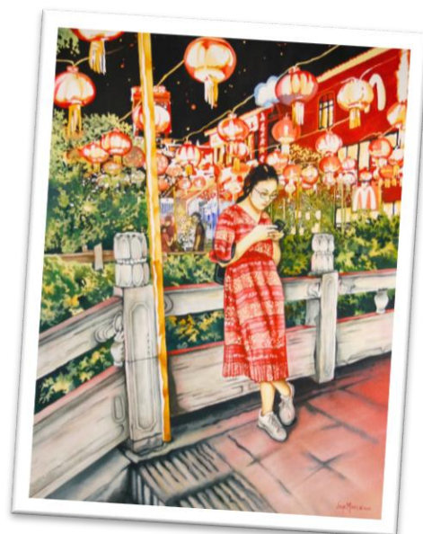
2019 Aqueous exhibitors