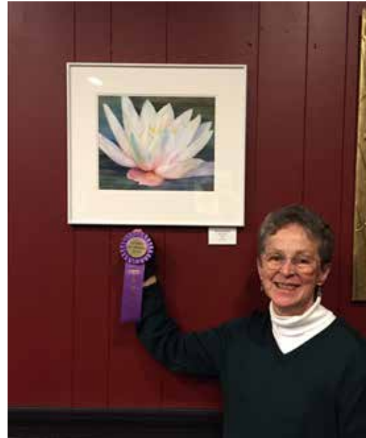
Rema White White Waterlily