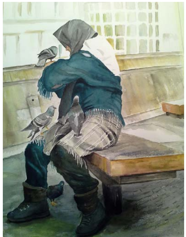
▲ Jane C. Michael Award of Merit – “Bird Lady of Cologne”