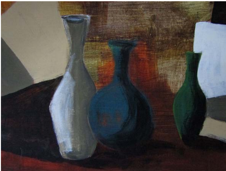
Ginger Danz Award of Excellence – “Vintage” ▲