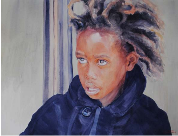
Connie Clutter Award of Excellence – “Awestruck” ▲